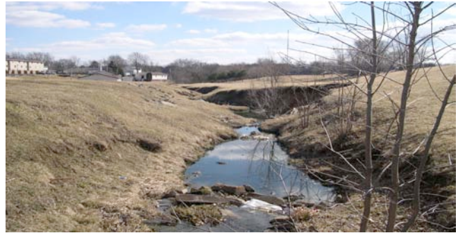
Urban stream ravaged by urban runoff.

While rooted in agricultural assistance, Iowa's central NRCS office in Des Moines has supported a full-time urban conservationist since 1997. This person has been instrumental in introducing the concepts of