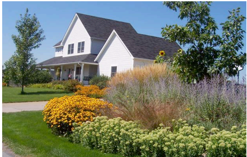
Example of a rain garden.

Iowa Heartland RC&D is a relative newcomer to stormwater management work. With funding from the NRCS, demonstration projects of various stormwater best-management practices have been installed throughout central Iowa. Iowa Heartland RC&D has one full-time employee dedicated to erosion and sediment control issues and recently received Watershed Improvement Review Board funding to reduce and improve urban stormwater runoff in the Saylor Creek watershed in Ankeny.