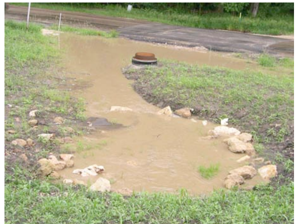
Above, sediment-laden runoff leaving a new housing subdivision, June 2007. Below, the same runoff flows quickly into a local creek.

Phase I of the stormwater permit program addressed sources of stormwater runoff that had the greatest potential to harm water quality. Under Phase I, EPA required permit coverage for the following dischargers of stormwater: