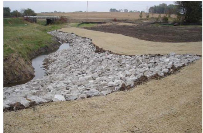
As with any problem, fixing rather than preventing is costly.